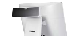
Customer Display • VFD (2 Lines x 20 Characters)