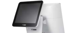
2nd Display • 9.7", 12.1", 15" LCD